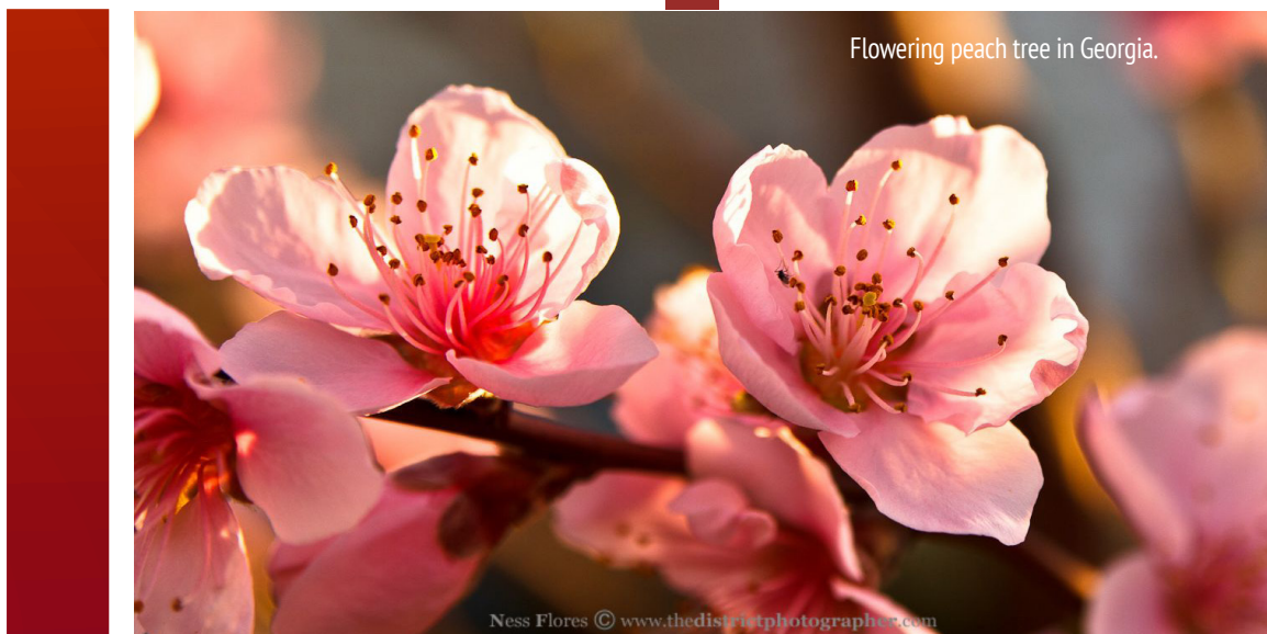
Flowering peach tree in Georgia.

Ness Flores © www.thedistrictphotographer.com